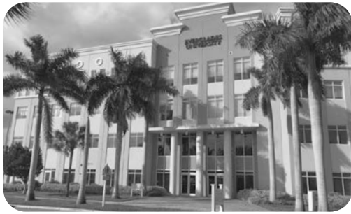
Miami Branch Campus