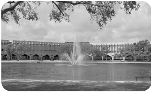
Boca Raton Main Campus and Online Division