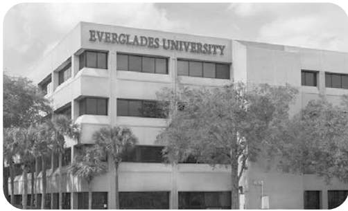
Orlando Branch Campus