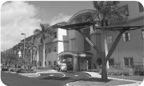
Sarasota Branch Campus